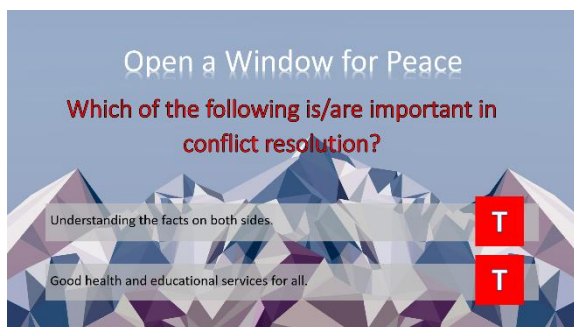
Figure 4 The Final Questions for the Red Team