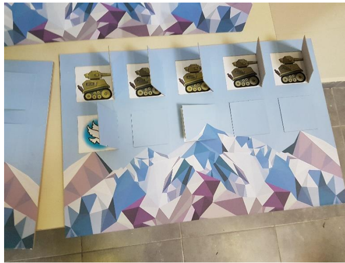
Figure 1 Our board with the Windows of War and Peace.

Our main aims were to promote peace and encourage students to interact with the exhibits. We also wanted to show that games and video games in particular can be used to promote peace instead of war. Hence through this activity we also introduced our peers to educational video games like Global Conflicts Palestine and Global Conflicts: Child Soldiers .