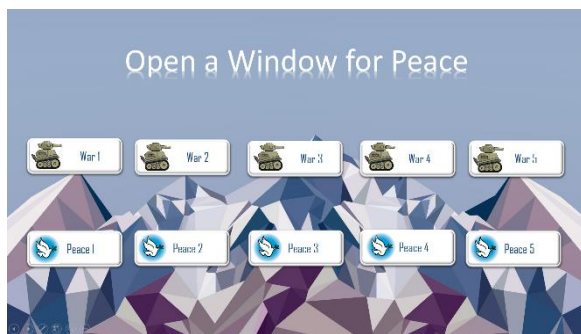
Figure 2 The Windows