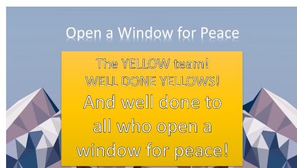
Figure 5 Congratulations message for the winners